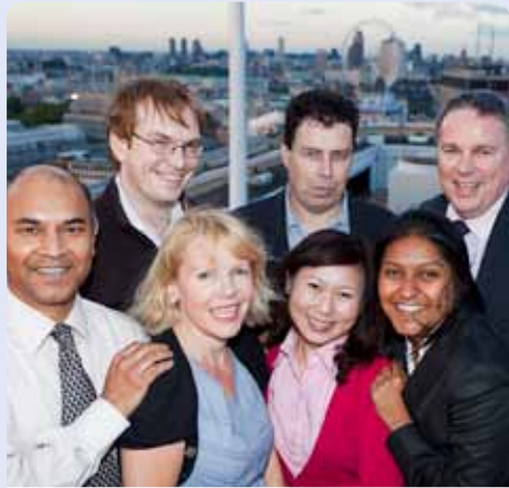
Committee members at a networking event on 8 June 2011

Our challenge as a committee is to ensure we develop a programme of engagement that will amaze and delight. We are looking to connect the disparate and disconnected. Whether