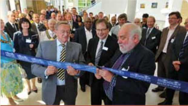
Sir Ken Morrison opens new School of Management building: more than 100 of Yorkshire's leading business figures joined the former chairman of the supermarket chain Morrisons in July 2010 at our launch event.