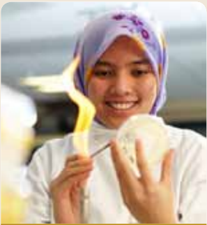
University announces HE STEM programme: It was announced that the University will be one of six to benefit from a share of £21 million to promote Science, Technology, Engineering and Mathematics (STEM).