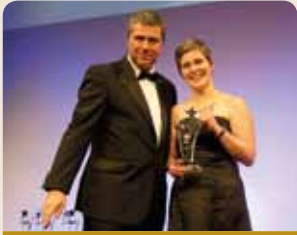
University wins green accolade: the University was acclaimed as the leading university for sustainable development at a national awards ceremony for the second year running in November 2010.