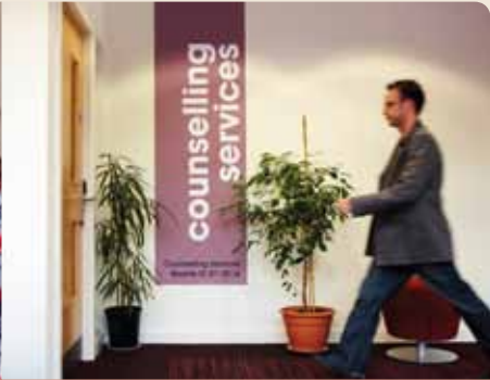
The 'Commie' building becomes Student Central: Student Central opened in September 2010 providing a new heart of activity for students on campus.