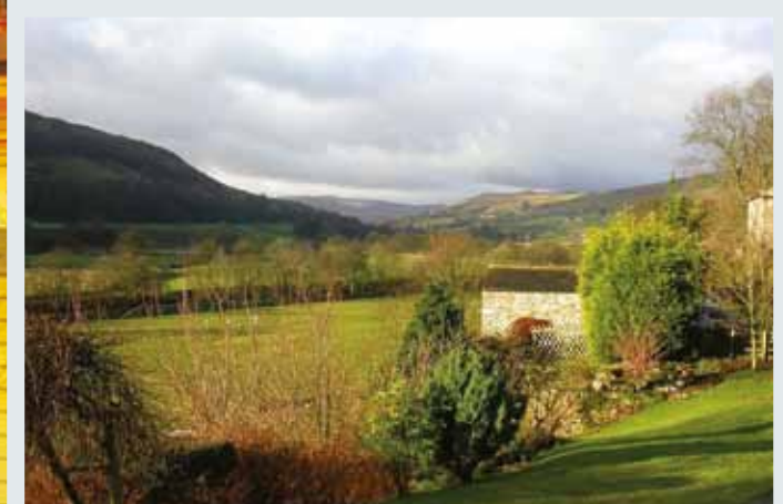
Yorkshire Dales and Alhambra Theatre, Bradford